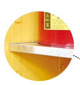
Adjustable shelves with antileakage design